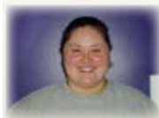
Athlete: Cheryl Haworth Sport: Weightlifting # of Years Competing: 10 Hometown: Savannah, Georgia

In this issue of Loudspeaker, Olympic and Paralympic athletes speak out about how dedication and determination have led them to where they are today in their athletic career.